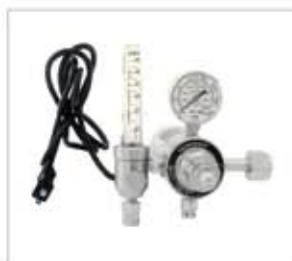
Generico CO2 Regulator with Heater