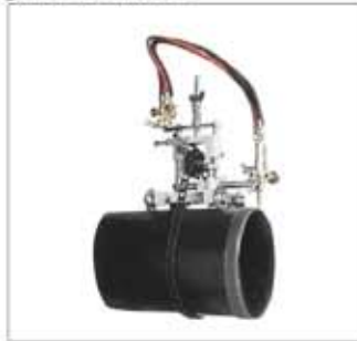
Hand Pipe Cutting Machine