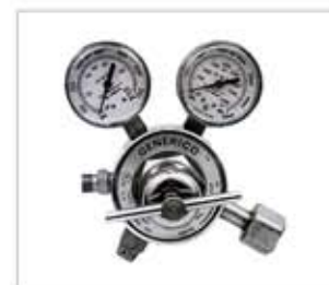
Generico 452N Nitrogen Regulator