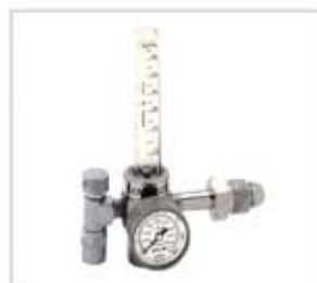
Generico 191A Argon Regulator