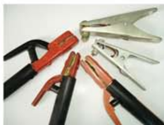
Electrode holders & earth clamps