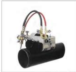
Magnet Pipe Cutting Machine