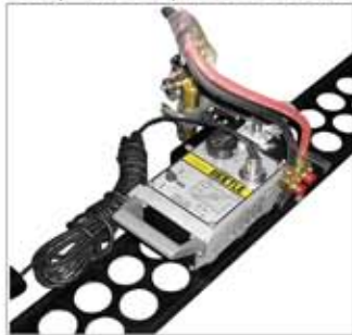
Portable Gas Cutting Machine