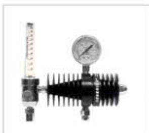
Generico CO2 Radiator Regulator with Flowmeter

Range of Oxygen, Acetylene, Argon, Carbon Dioxide & Nitrogen Regulators.