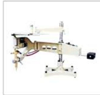
Profile Gas Cutting Machine