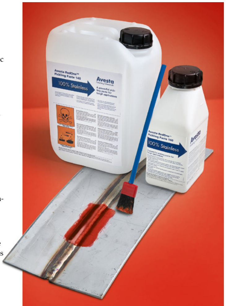
Avesta RedOne™ Pickling Paste 140 is unique and patented.