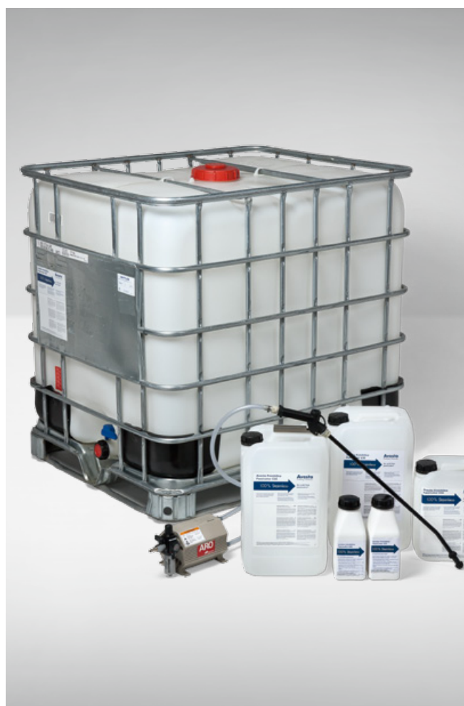
Avesta FinishOne™ Passivator 630 helps speeding up the thickness of the passive layer.

Avesta Cleaner 401 can be used together with Avesta FinishOne™ Passivator 630, which helps regenerate the protective layer in the stainless steel by speeding up the thickness of the passive layer.